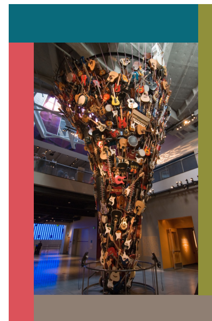
The Experience Music Project Museum (EMP) is home to the famous three story guitar tower, a spiraling collage of musical instruments.

5:30 PM Officer Installation Reception and Dinner